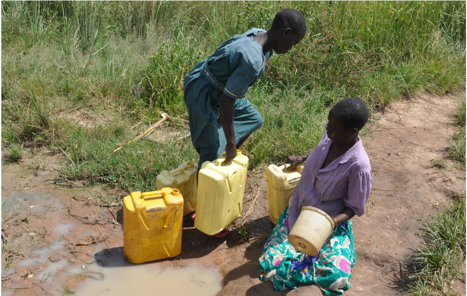
collecting water before school