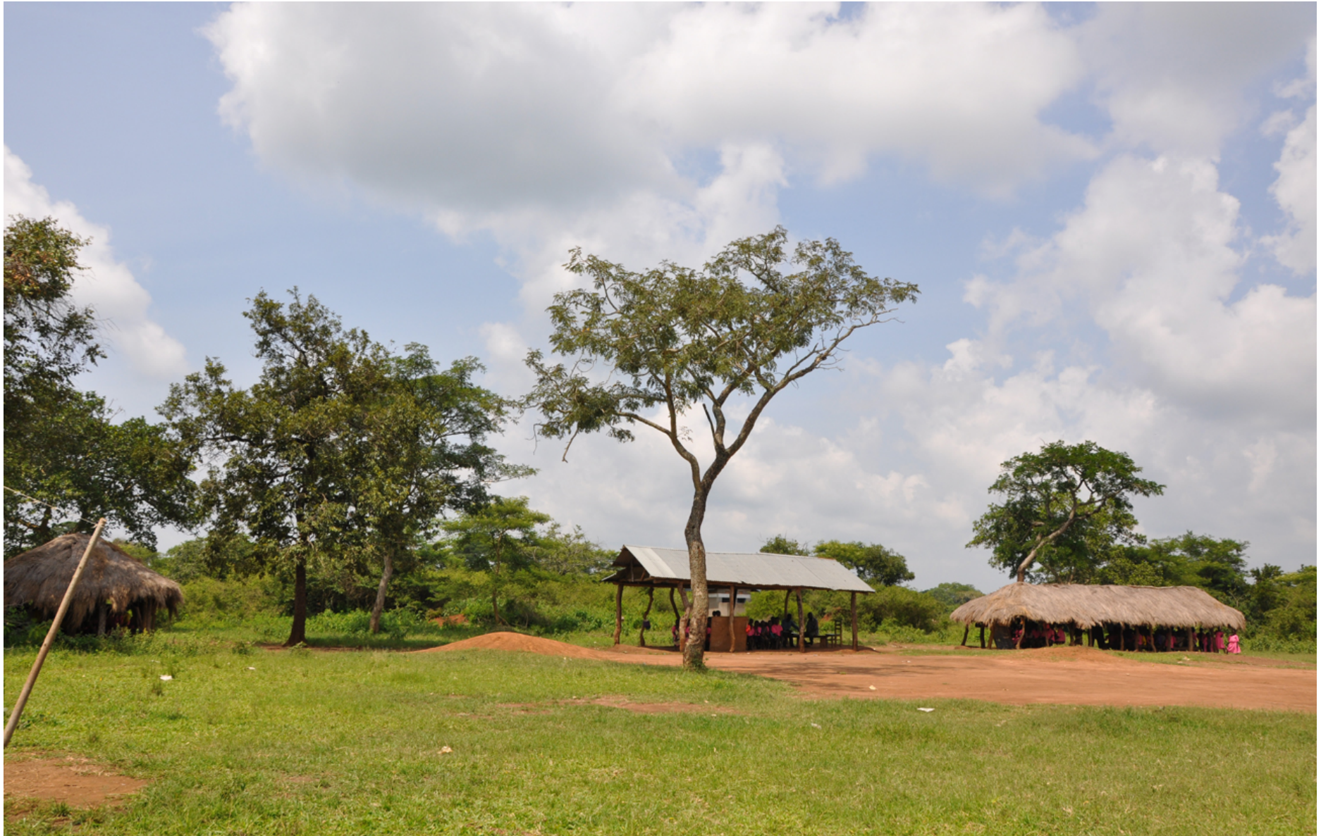
classroom with thatch roof