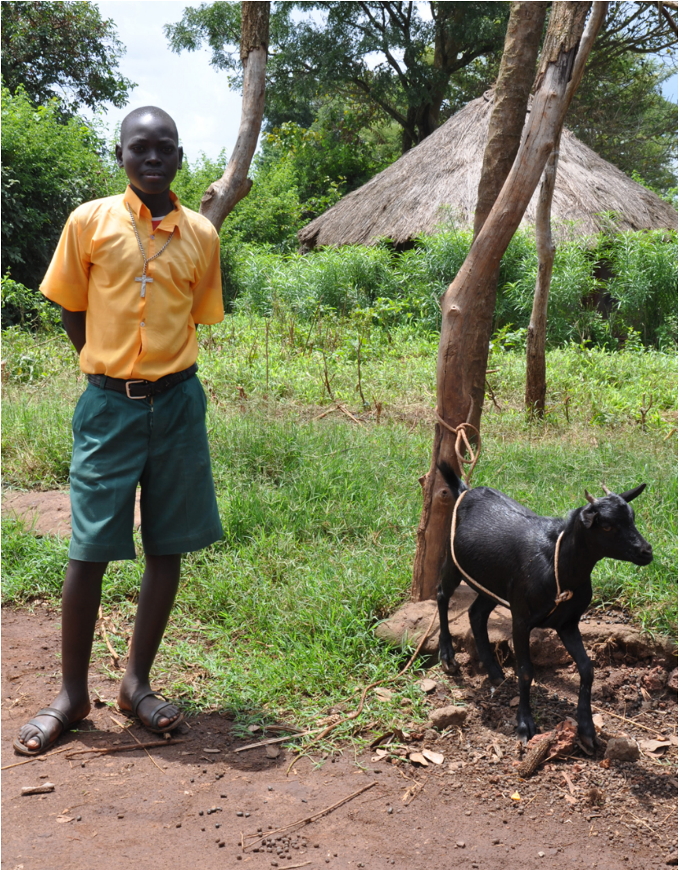
looking after the family goat