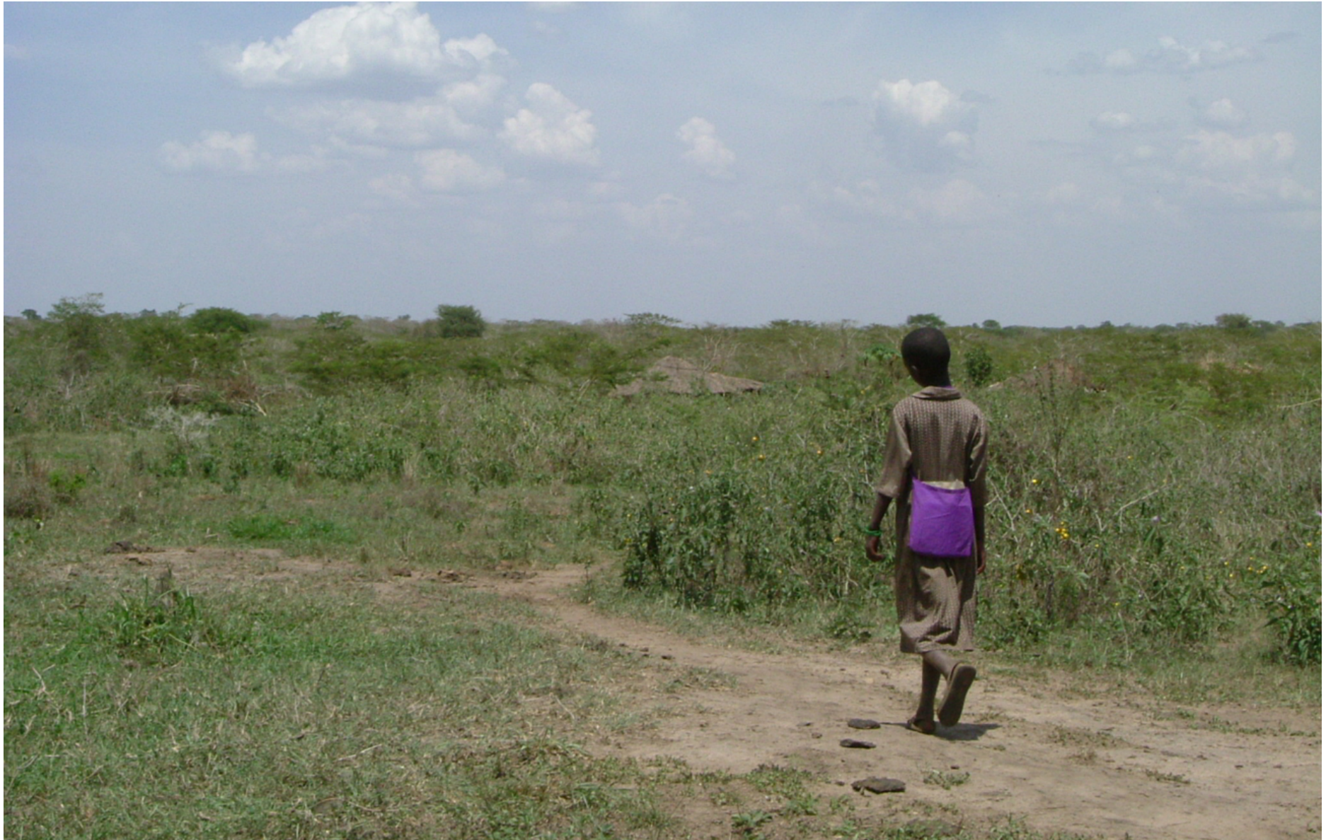
walking to school