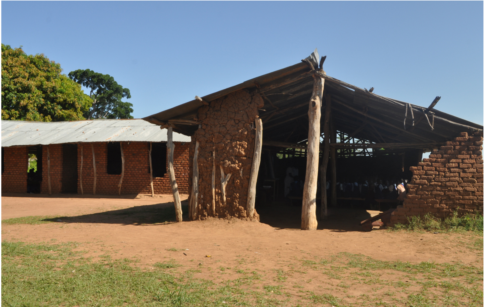
classroom with mud walls