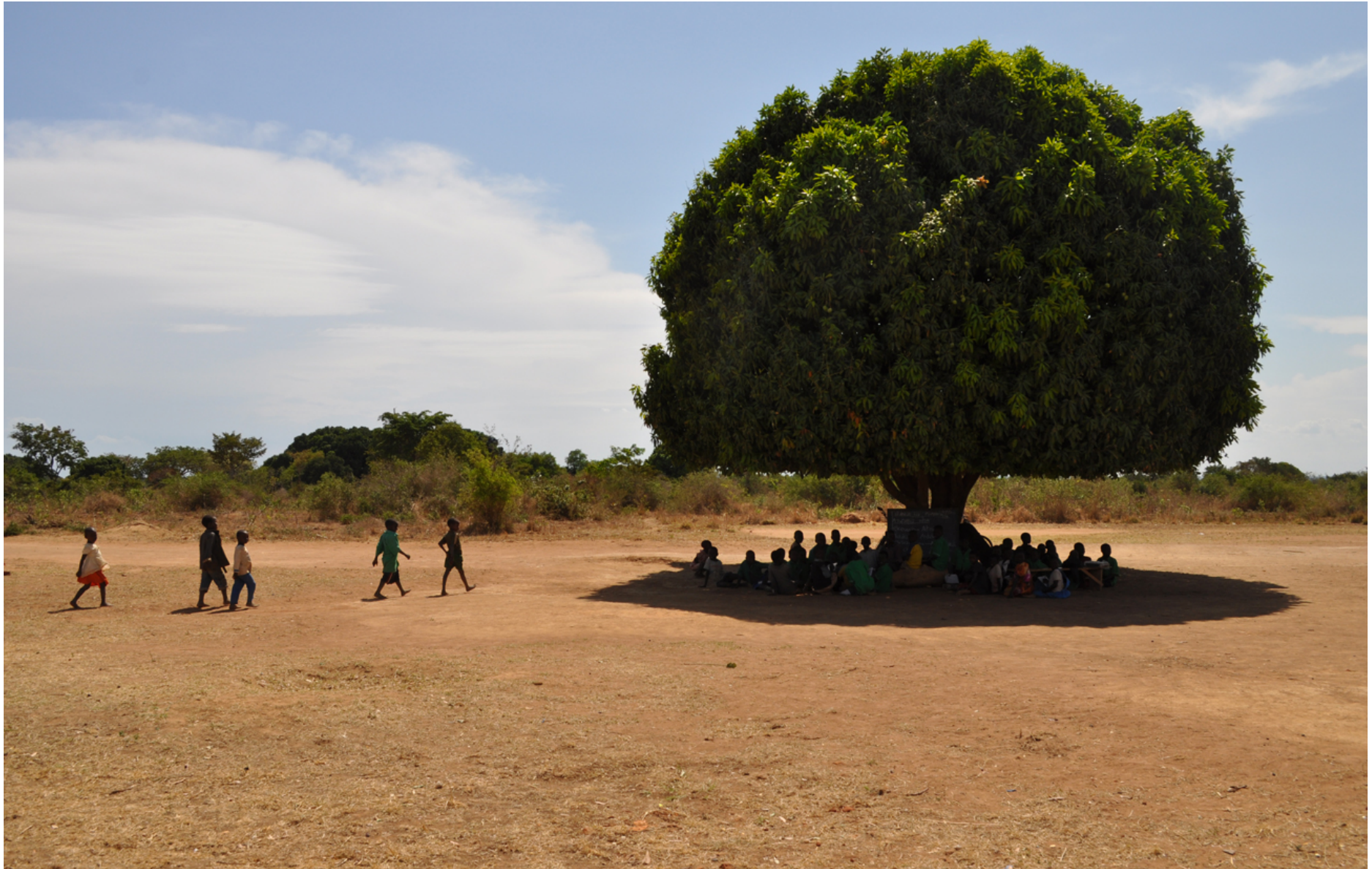
class under a tree